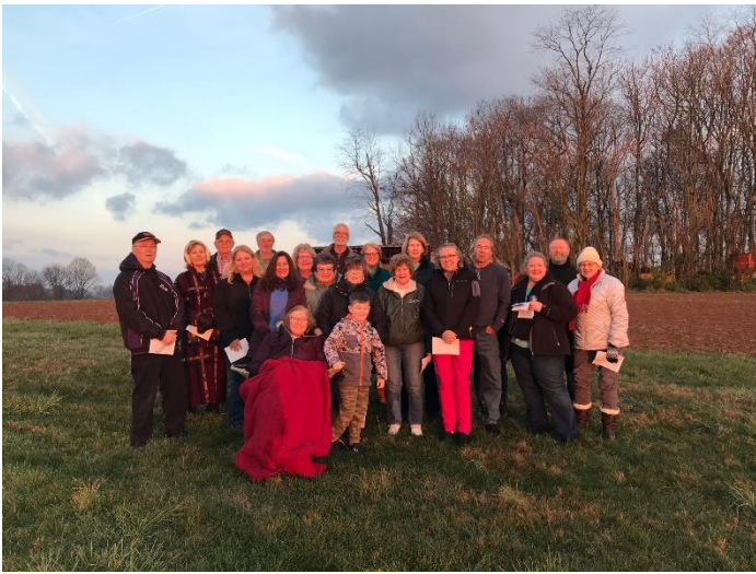
Easter Sunrise Service at Airview Farm