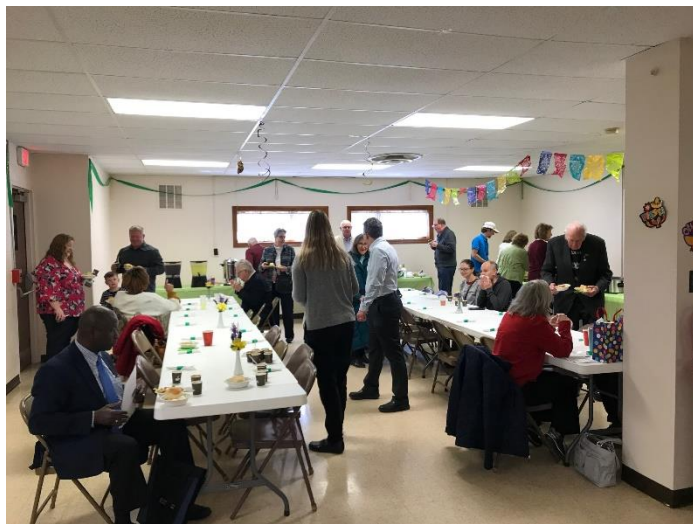
Jennings Chapel, Morgan Chapel, Mt. Olive, Poplar Springs, and Lisbon worshipped together on March 19 followed by chili, cornbread, cake, and fellowship.

Ordination – Saturday, June 3 at 2:00 pm