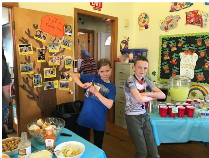
To all that came out to the Spaghetti dinner on March 19 to support our youth in mission to Camp Hope – Thank You!