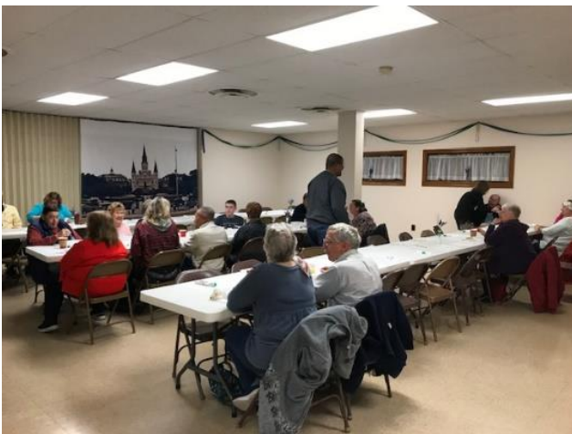
Good food and fellowship at the co-operative Shrove Tuesday Pancake Supper.

The Trip Down Memory Lane was enlightening. Great stories and great fellowship.