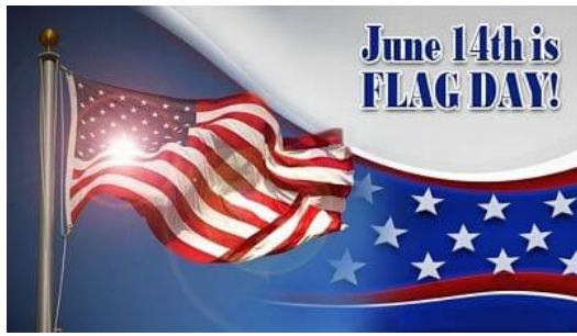
The Birthday of the Stars & Stripes