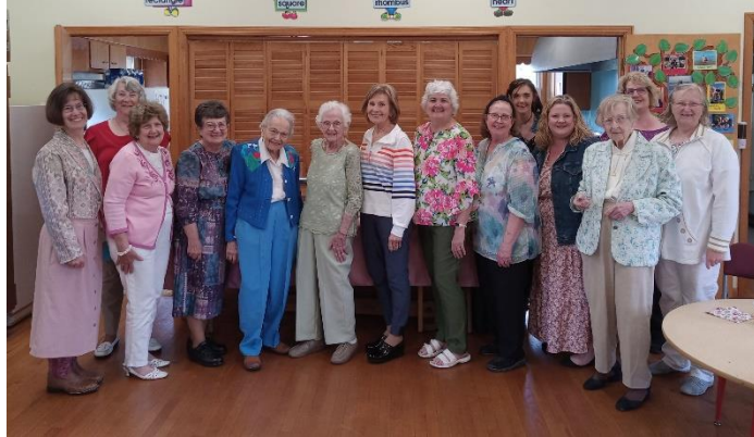
The beautiful women at Poplar Springs celebrate Mother's Day, 2024