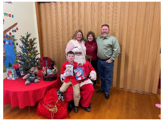
Poplar Christmas Party, December 10, 2023